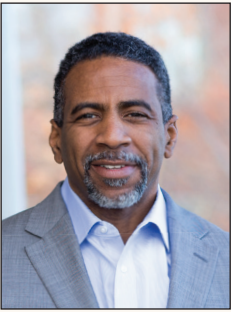
The Nativity Narrative—Page 2