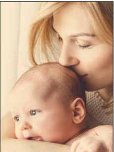
Fatherhood Rejected—Page 3