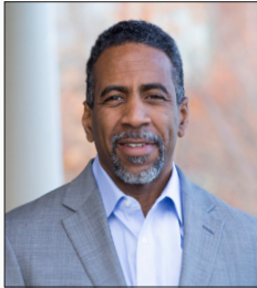
Why Discipleship is the Key to Ending Abortion Page 2