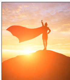
Help Save Lives 365 Days a Year! Page 3