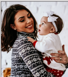
God Guided Hana's Steps Page 3