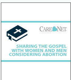
Sharing the Gospel with Women and Men Considering Abortion eBook Page 4