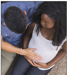
Truth and Grace Triumphs Page 3