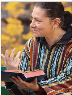
Making Life Disciples Online— Page 4