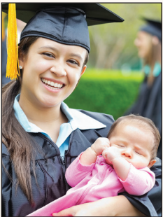
Life Decisions Need Life Support!— Page 3