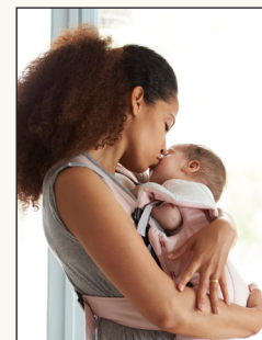
Freedom from Shame! —Page 3