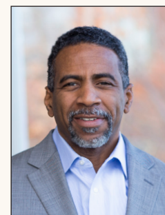
How an Easter "Abortion" Became an Easter Miracle—Page 2