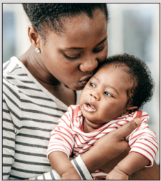
Prodigal Daughter, Loving Father Page 3