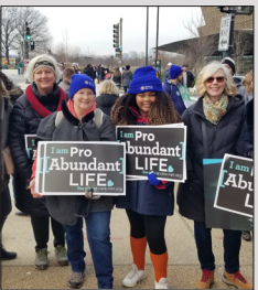
March for Life Page 4