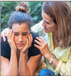
Closing the Gaps Page 3