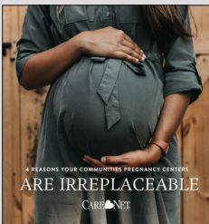
4 Reasons Pregnancy Centers are Irreplaceable eBook Page 4