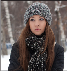
Alone and Afraid PAGE 3