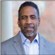
Why We Put Christ at the Center Page 2