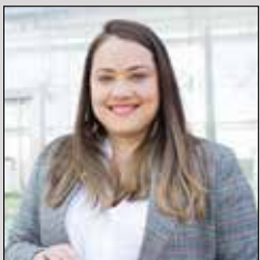
Saved by the Grace of God Page 4