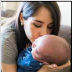
Out of Darkness, Into the Light Page 3