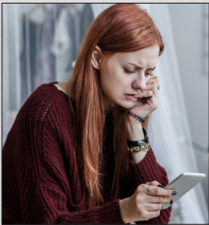
Dawn's Search for the Truth PAGE 3