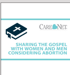
Sharing the Gospel with Parents Considering Abortion eBook PAGE 4