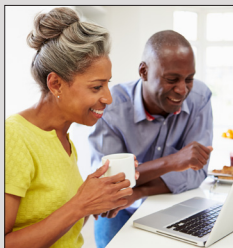
Legacy Giving PAGE 4