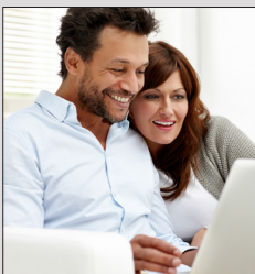
Legacy Giving PAGE 4