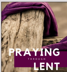
Praying through Lent! PAGE 4