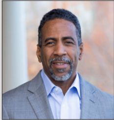
The Year of the Gospel PAGE 2