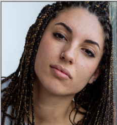
You Not Only Saved Mia's Baby . . . PAGE 3