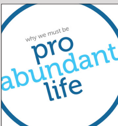
Why We Must Be Pro Abundant Life Free Download PAGE 4