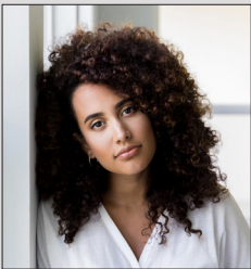
Finding Courage in Christ PAGE 3