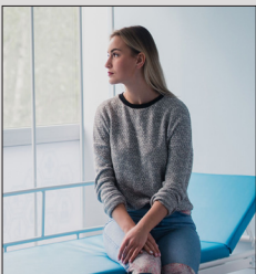
Her First Thought Was Abortion PAGE 3