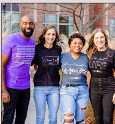
Wear Your Heart on Your Sleeve PAGE 4