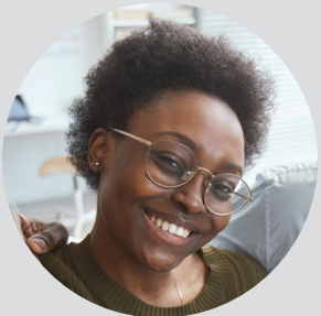
New Parents, New Disciples Page 2