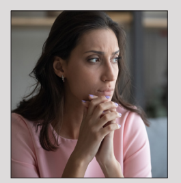
A Life-Saving Connection PAGE 3