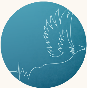
Reclaiming Fatherhood Page 4