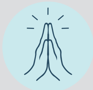
Abundant Life Prayer Network Page 4