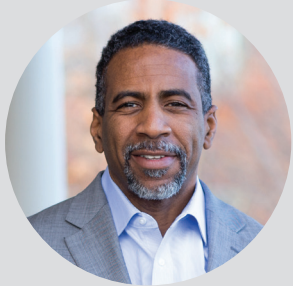
Serving Dads in the Pacific Northwest Page 2