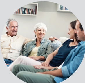
My Treasure is in Heaven Page 4